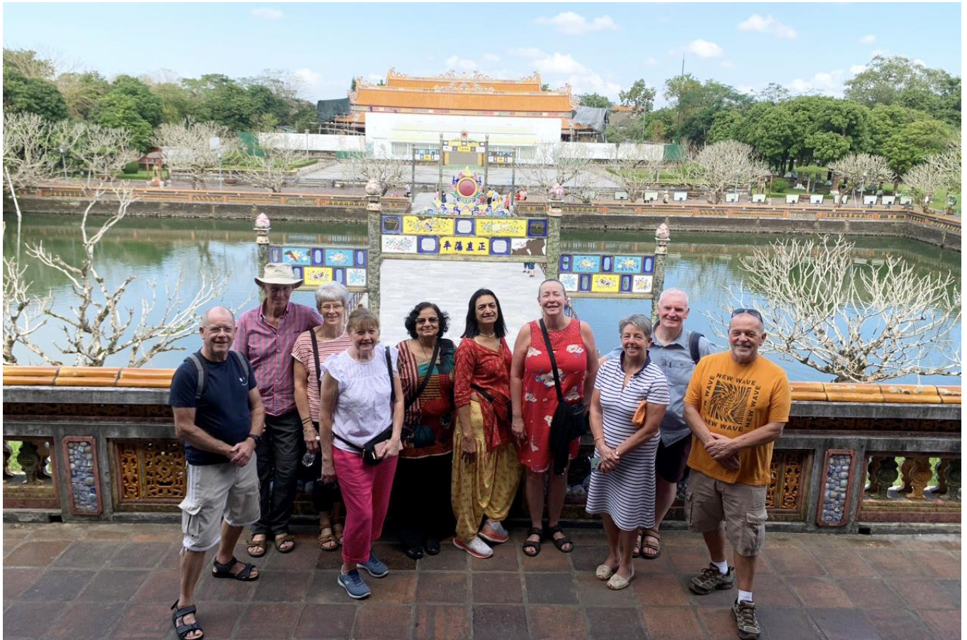
Hue Imperial Citadel