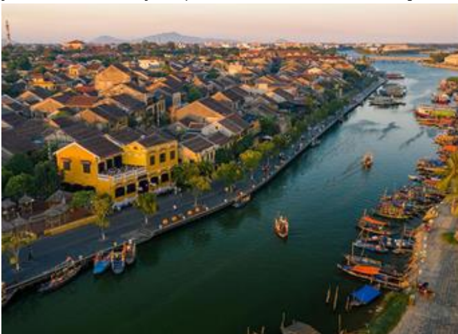
The overview of Hoi An Ancient Town

After breakfast, travel about 50km from Hoi An to My Son sanctuary . It comprises many Champa temples, in a valley roughly two kilometers wide, surrounded by two mountain ranges. It was the site of religious ceremony of kings of the Champa dynasty, and was also a burial place of Champa royals and national heroes. The My Son temple complex is one of the foremost temple complexes of Hinduism in South East Asia and is the foremost heritage site of this nature in Vietnam. Though the complex has been destroyed over time, you still see many majestic ancient ruins of temples in the area. Back to Hoi An, have lunch at local restaurant.