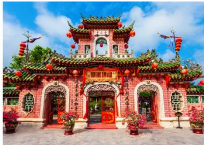
Fukien Association temple

In the afternoon, visit Family Chapel built by prominent, merchant or official families as the center ancestor worship a Chinese style Pagoda or Assembly Hall: Japanese Covered Bridge Pagoda which is the first bridge on this site and was constructed in 1593 by Japanese community of Hoi An to link the Town with the Chinese Quarter across the stream, besides looking at Fukien Association temple, Ceramic Museum and Chua Ong Temple .