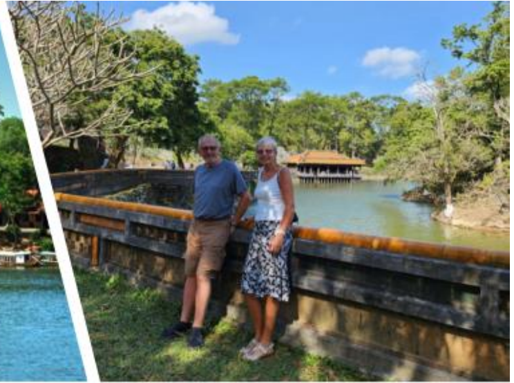
Emperor Tu Duc