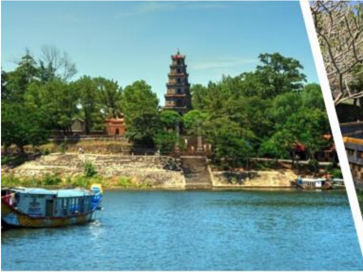
Thien Mu pagoda